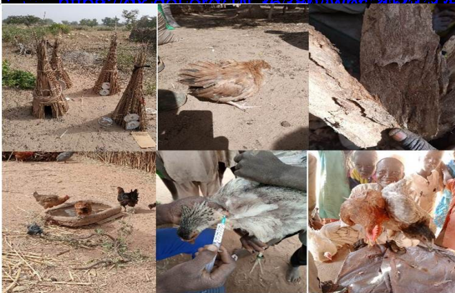
Moustapha A, Adamou A, and Talaki E (2022). Characterization and Typology of Traditional Poultry Farming Systems in Northern Chad. J. World Poultry Res. 12 (4): 345-357. DOI: https://doi.org/10.36380/wjpr.2022.37