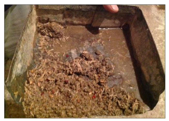
Figure 2. Larvae and pupae of flies from the litter channel