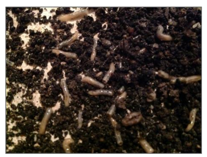
Figure 1. Larvae and pupae of flies from the passage between the batteries

The number of imago flies in hen-houses was dynamically evaluated using flypapers (flycatcher "Mukholov-Kapkan", Avantari, Russia), six flypapers in each hen-house situated in different levels above the floor. After 24 hours, flypapers were removed and the number of stuck insects was counted. For the dynamic evaluating amount of larvae, the specimens obtained from the floor, with a surface area of 10 \times 10 cm and weight of 3-5 g. In addition, contents of dung channels under battery cages were sampled using a special sampling device. Six aliquots were taken from each hen-house (Figures 1 and 2). At first, feces sampling was performed at the end of growing period of previous bird batch, in 24 hours after complex insecticide program, and then weekly for the entire duration of broiler growing.